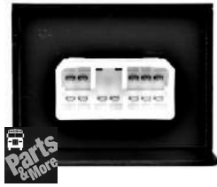
SBF-94 INPOWER, ELECTRONIC FLASHER