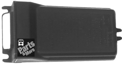
7000M WELDON FLASHER