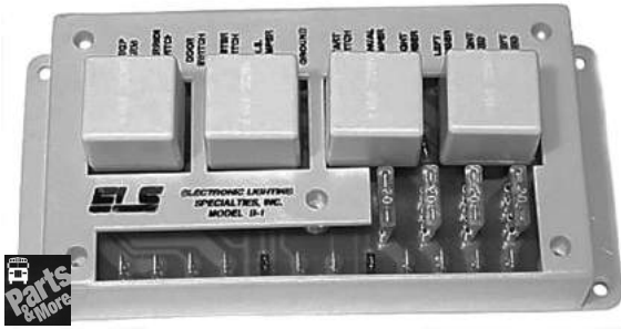
B-1 ELS FLASHER 3010 RELAY